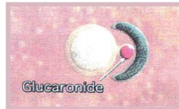
3. Through glucuronidation, harmful substances are removed from cells, made water soluble and eliminated from body.