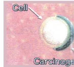
2. Carcinogens attack cells.