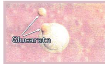
1. Glucarate enters cells.