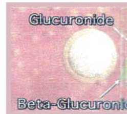
4. A harmful enzyme often glucuronidation, releasing back into the body.