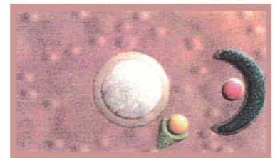
5. Glucarate from cells bonds with the enzyme, preventing its harmful action.